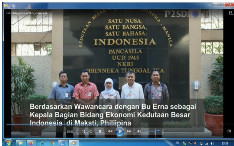
Figure 1. Librarian Participated in the Research