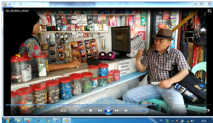
Figure 2. Taking in-depth Expert interview with Small Businesses