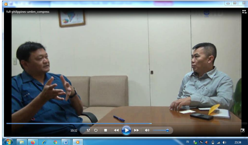
Figure 3. In –depth Expert interview Shooting